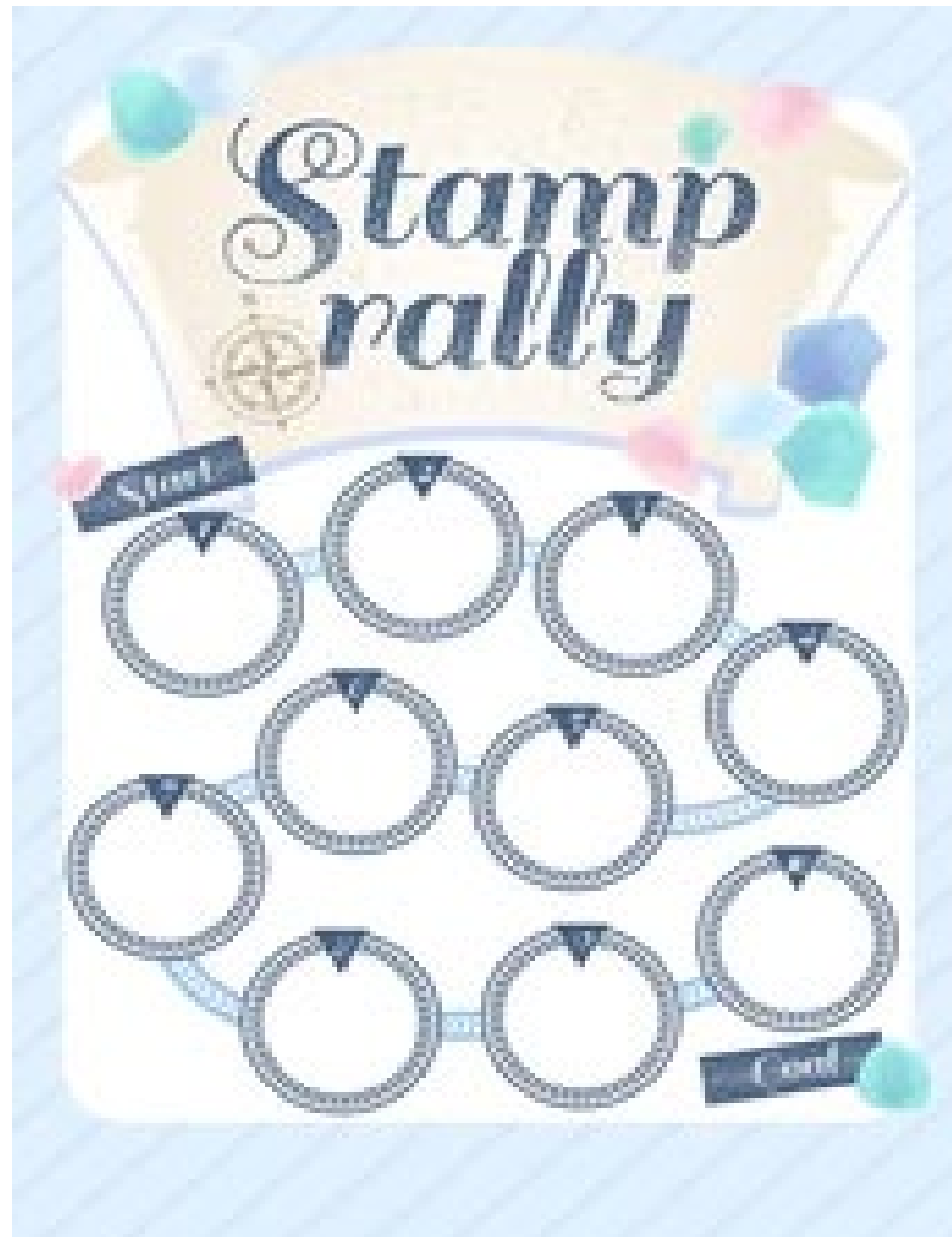
Sample stamp card Final card will be previewed by sponsor